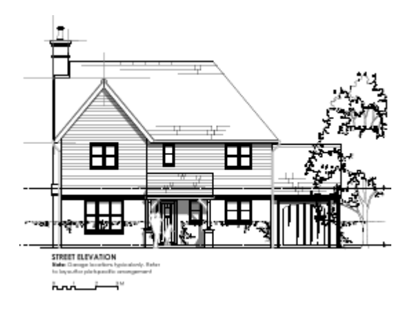
Brookfield House Type